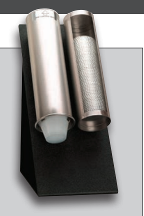
SFL-STAND-2 shown with SFL-ADJ and SFL-TLD portion cup & lid dispensers.